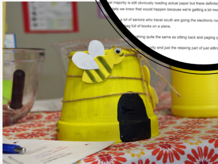
The craft of the night: Bee Hive Flower Pot Decorations.

The Jake Epp Library hosted what they called their "Crafts and Laughs Night" this Tuesday evening. The goal was to