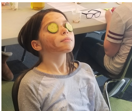
We also hosted a Teen Spa Day in February, pictured here

Jake Epp Library is always a busy place during Spring Break when the kids are out of class. This year, we hosted 4 different events