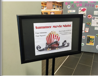
Movie Night every Thursday at the Jake Epp Library.