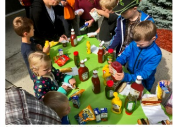
Parents and kids involved in the Summer Reading Club enjoyed a free BBQ on Tuesday.