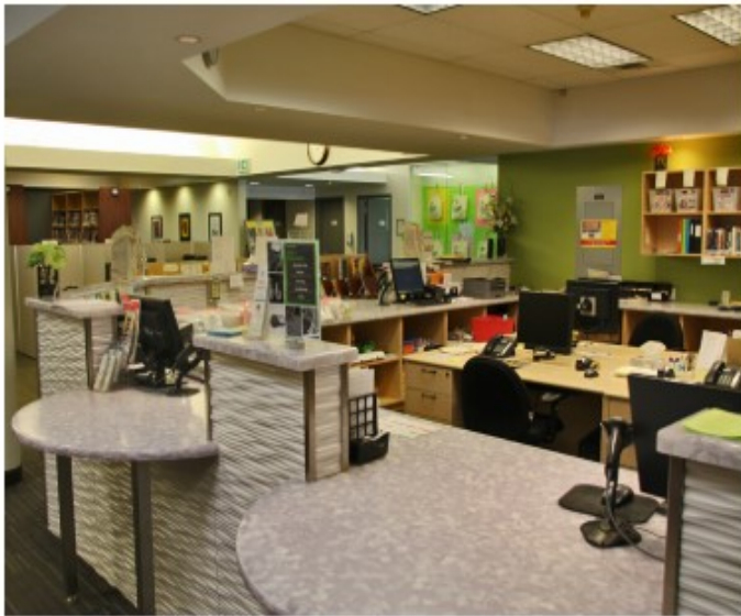
The outdated administration computers in the Jake Epp Library can now be replaced thanks to Steinbach City Council.

Steinbach City Council has voted to give the Jake Epp Public Library a one time technology grant of $7,527.